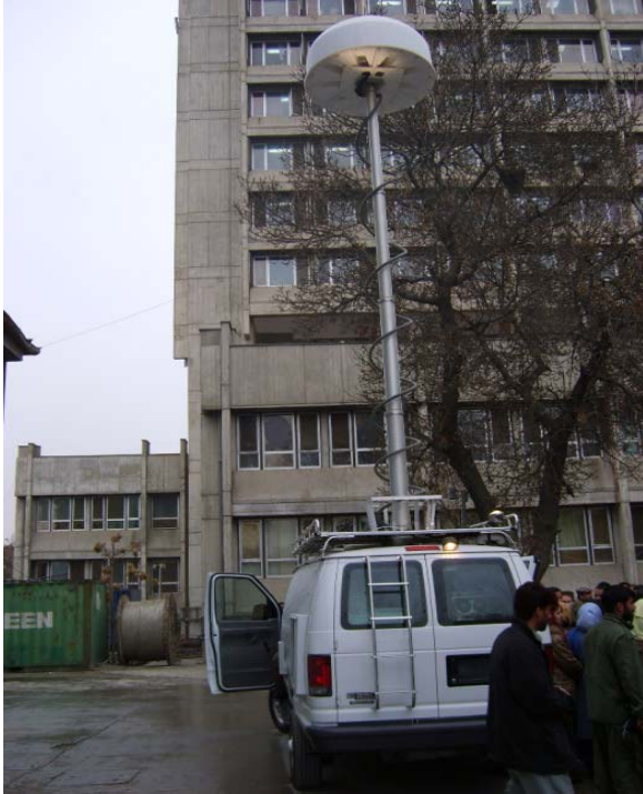
The radio spectrum installed at Ministry of Telecommunications in Kabul.

Parwan, Kapisa, and Panjshir. In the meantime, since June 2006, the Ministry is also responsible for delivering Basic Package of Health services in three districts of Kabul province. The project is also financing two research projects on a Safe Water System and Health Care Financing. The Safe Water System is being carried out in Wardak province and is testing a variety of approaches for decreasing diarrhea and other water-borne illnesses by early 2007. The user charge and control arms of the Health Care Financing project are examining a few approaches to community health financing and will be completed by May 2007. Findings from these two pilots will guide policy formulation on safe water systems and revenue generation for the health sector in the future.