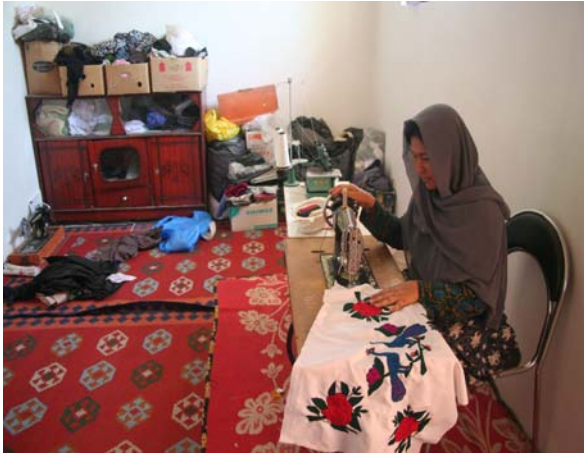
A Woman in Herat Province uses microfinance credit to set up her business.

Currently there are 11 ongoing investment projects funded by the ARTF with combined commitment of around US$350 million as follows. For ARTF co-financed investment projects, please see above.