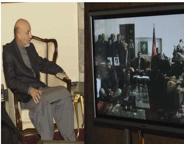
President Karzai meets Paktia provincial authorities through a video conference facility.

The Rehabilitation of Telecommunications Systems Project (US$6.1 million) aims to establish international connectivity between Afghanistan and other countries, particularly neighboring countries. The project consists of three components: rehabilitation of the satellite earth station in Kabul, expansion and improvement of transmission links, and the billing system. The expansion and improvement of telecommunication transmission links has been completed and is operational. The satellite earth station at Mahtab Qila in Kabul has also been rehabilitated. The project is expected to be completed by end-December 2006.