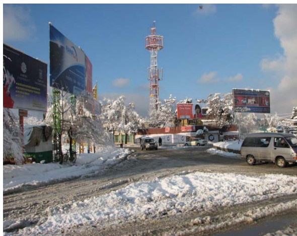
Winter in Kabul. Kabulis witness the hardest winter this year, as snowfall reached 70 centimeters.