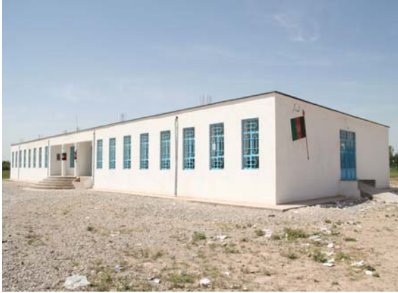
A school building was built in Herat Province.

is under preparation along with a review of the legal framework associated with audit activities.