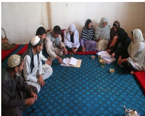
Members of a community council discuss their priority needs in Bamiyan Province