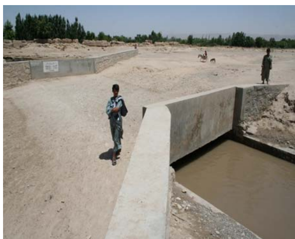
A bridge being built through National Rural Access Program in Kunduz Province.

Audit Agent: The audit advisor has assisted the Control and Audit Office with the audits of IDA projects, Afghanistan Reconstruction Trust Fund (ARTF) projects and cost expenditures, and the state budget. In addition, over 100 staff have participated in various training courses including computer and language training, technical audit, and modern audit working practices and procedures. A strategic development plan