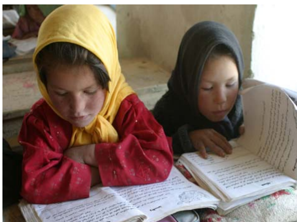
Two Bamiyani kids are attending a school near Bamyan capital.

The Emergency Transport Rehabilitation Project (US$108 million Credit and US$45 million Grant) is helping to remove key transport