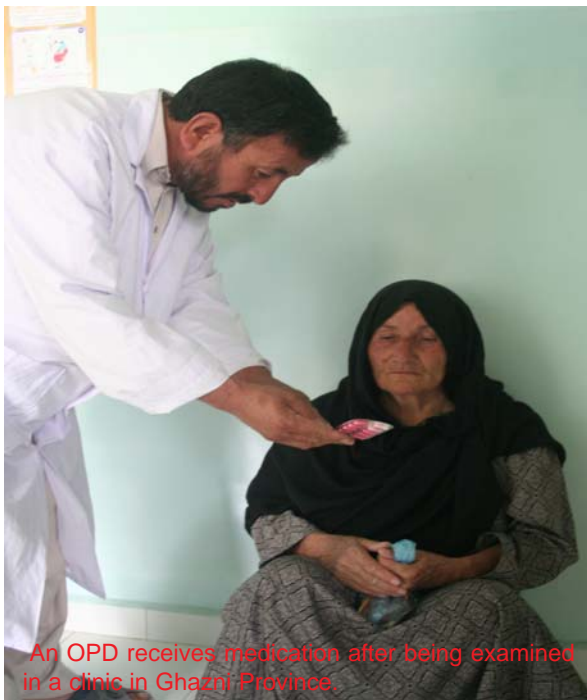
An OPD receives medication after being examined in a clinic in Ghazni Province.

Civil Aviation: The Bank is also financing some emergency needs in the civil aviation sector including runway rehabilitation, emergency de-mining, and fencing of the Kabul International Airport. In addition, funds will provide navigation and communication equipment for Kabul and other provincial airports. The Kabul Airport runway was formally inaugurated on August 9, 2005.