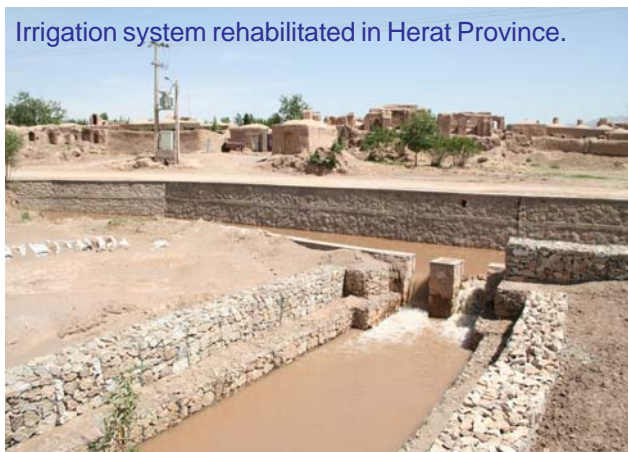
Irrigation system rehabilitated in Herat Province.

rehabilitation of the national irrigation system in all five river basins of Afghanistan. To date, six regional offices in Kabul, Jalalabad, Kandahar, Balkh, Kunduz, and Herat have been established to develop institutional capacity at the local level. As of December 31, 2006, 635 subproject proposals costing about US$50.3 million have been prepared. Out of these subproject proposals, 523 subprojects totaling US$34 million to bring 289,825 ha of land area under irrigation have been approved; contracts for 399 subprojects worth US$16.4 million have been awarded and are ongoing; and 267 subprojects have been completed. In addition the first phase of the works under the contract for the emergency repair works to Band-e-Sultan Dam costing about US$500,000 have been completed, and design for the second phase of this project has been reviewed and submitted for approval. The work under the Feasibility Study of the Lower Kokcha Irrigation and Hydropower Multipurpose Project on