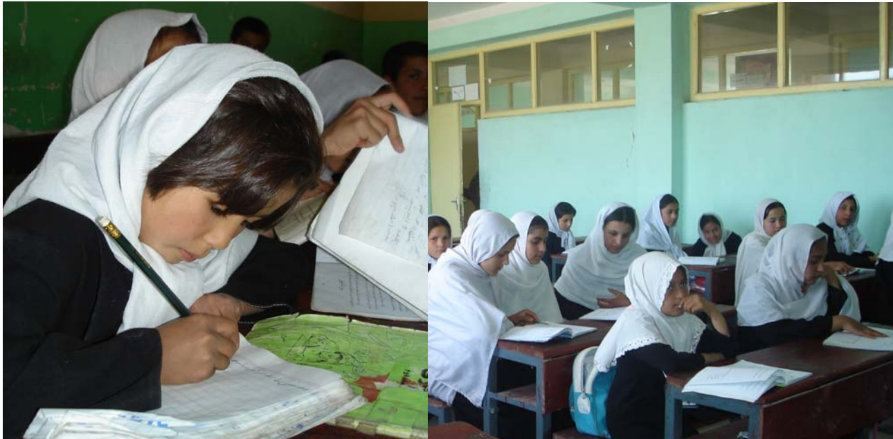
Afghan girls in the classroom

Afghanistan Gender Mainstreaming Implementation Note Series, No. 1 TOWARD GREATER GENDER EQUITY IN EDUCATION