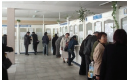
Customer service windows at the Bishkek City Gosregister Office

immovable property markets was higher. As the program shifted to rural areas, the program was coordinated with earlier government-financed programs to divide the state and collective farms inherited from the Soviet period into individual shares.