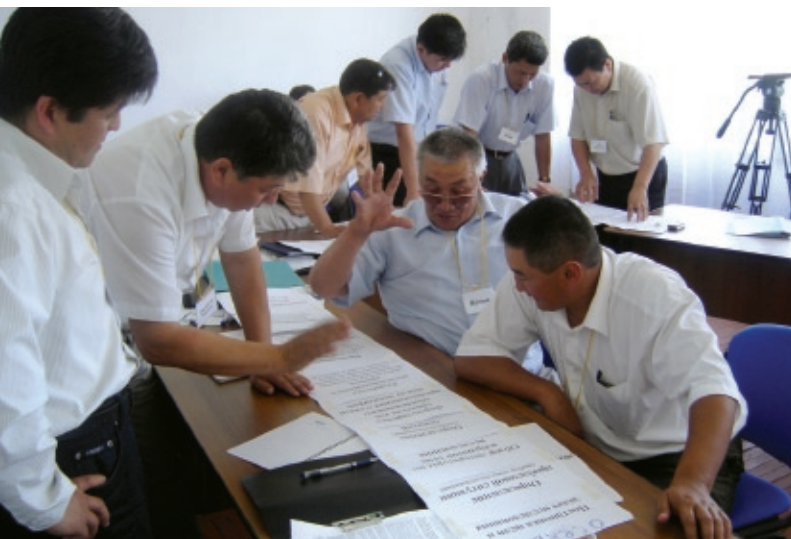
Reviewing field survey procedures in Gosregister

In 1996 the US Agency for International Development (USAID), World Bank, and other development agencies began working with Kyrgyz experts to draft the Registration Law that would be adopted in 1998. In 1999 the State Agency for Registration of Rights (Gosregister) was established, based on the examples of a number of existing institutions, including the Soviet era Bureaus of Technical Inventory and the Land Agency, which maintained information on land in urban and rural areas respectively. This solution offered two significant advantages to the property registration effort. First, the new Agency would start with staff, physical infrastructure, and direct access to existing databases on immovable property. Second, it meant that one agency was responsible for registering rights to land and maintaining the land cadastre.