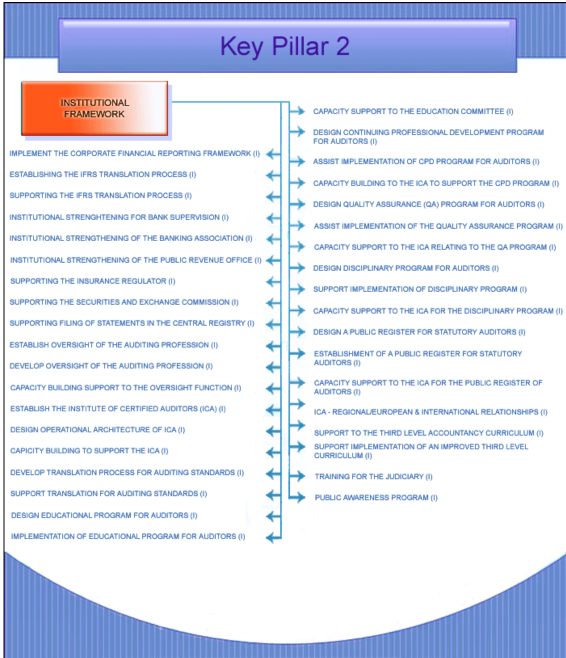
Figure 5-3: The Institutional Framework

Below in Figure 5-3: The Institutional Framework, we have set out the actions to be considered under the institutional framework.