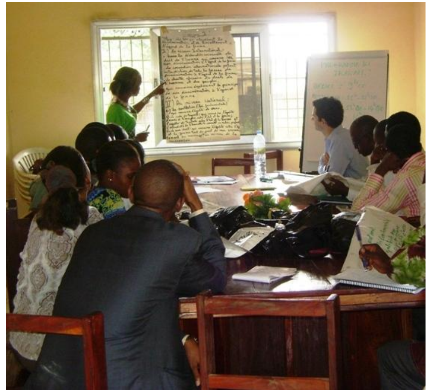
Training a Guinean CSO partner in conducting access to justice assessments