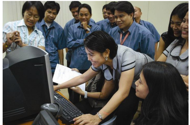
Case management training in the Philippines