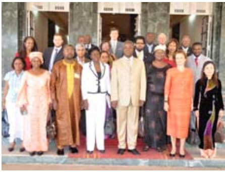
Burkina Faso: Delegates and Prime Minister