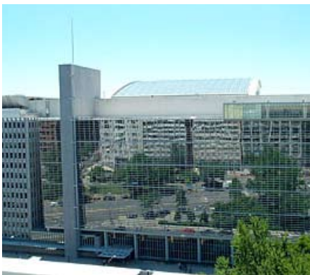
World Bank Head Quarters