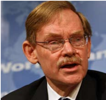
World Bank Group President, Mr. Robert B. Zoellick