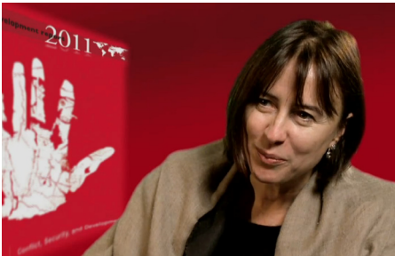
World Development Report 2011 Conflict, Security and Development