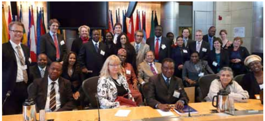
Parliamentarians visiting the World Bank Board Room

The training event was a mutual learning experience both for the attending parliamentarians and the seasoned World Bank and IMF speakers. World Bank Management expressed strong interest in addressing the parliamenta-