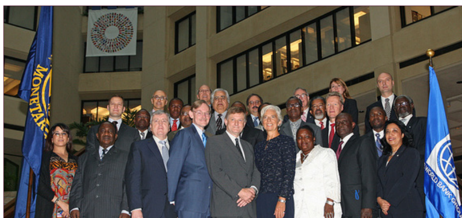
Parliamentary Delegation with IMF Managing Director, C. Lagarde & World Bank President R. B. Zoellick

World Bank President Robert Zoellick in his remarks referred to the Bank's decade long partnership with the Parliamentary Network, and em-