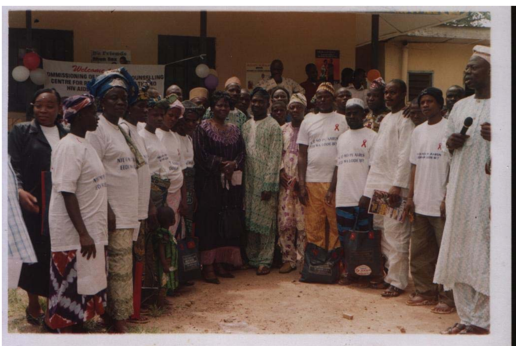
Partnership: Handing over ceremony to the Local Government Chairman at the conclusion of the NACA HAF 2 Project at Orire LGA-NIGERIA

At the national level, 103 CSOs engaged in all 36 states, including the FCT. Several of these have demonstrated best practices. Altogether (+State HAF), more than 1 000 CSOs are working nationwide.