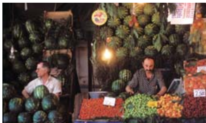
Small and medium enterprises are key to growth in the Europe and Central Asia region.

Project, will improve the living conditions of displaced people and enhance their economic opportunities and prospects for social integration. The Kyrgyz Rural Education Project will improve incentives for teacher performance and provide textbooks and other learning materials. The Second Health Project in Uzbekistan, an expansion of the pilot reforms supported under the First Health Project, is designed to increase access to and the quality of primary health care in eight regions. The Bank has also helped to raise awareness of poverty and human development issues of the Roma population and has secured the long-term commitment of various actors to improving opportunities for them (see box 2.3).