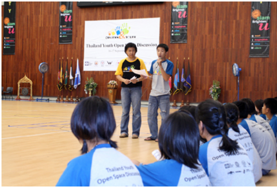
Youth voicing their opinions