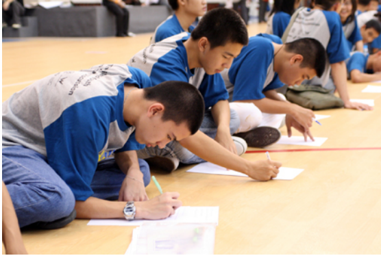
Youth - Brainstorming for ideas