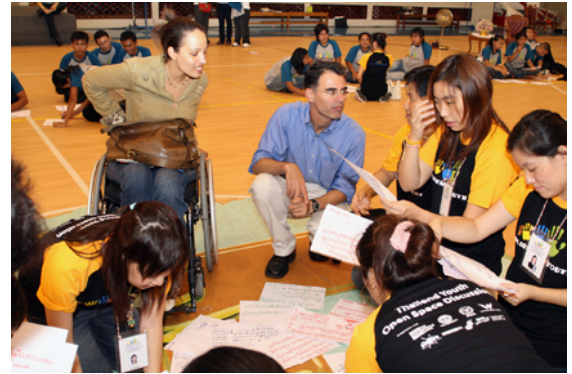
Youth Volunteers working hard