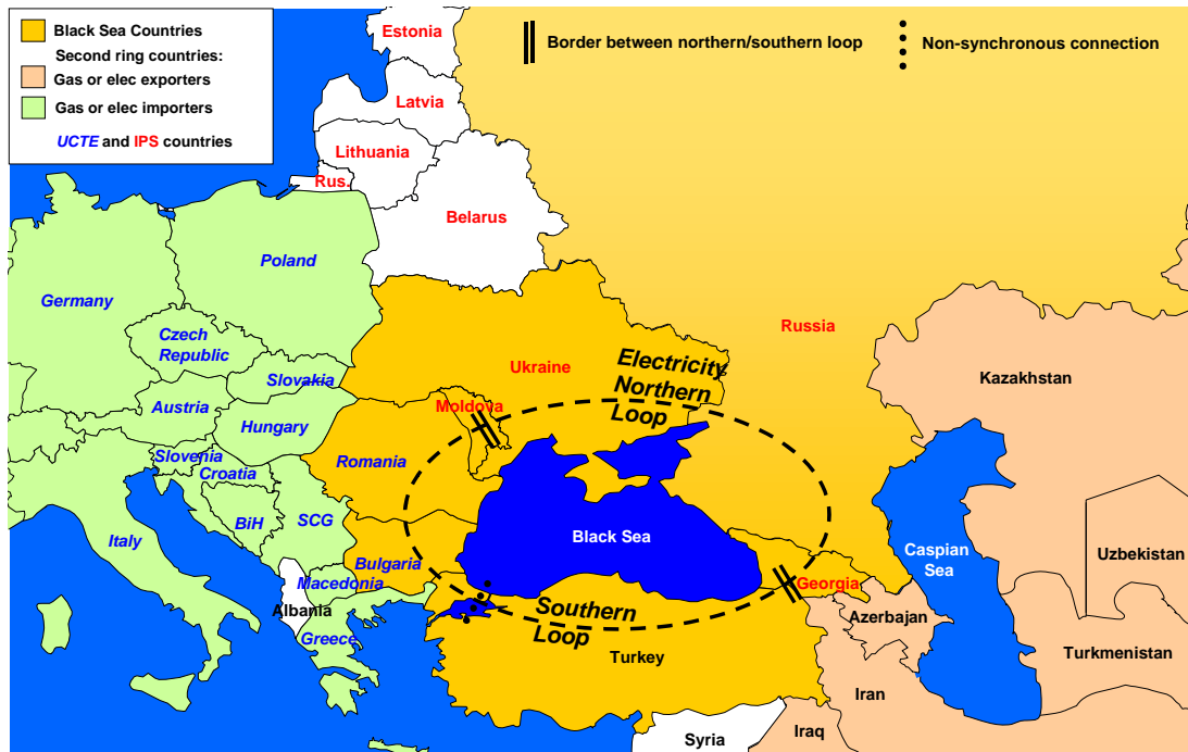
Figure 6.1: Potential Electricity Trade among Black Sea Region Countries.