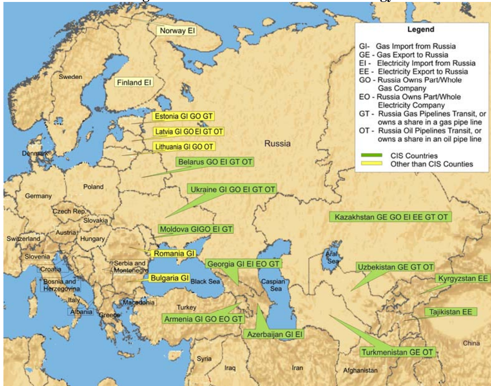
Figure 6.3: Russian Interest in FSU Energy Sector