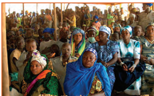
Community consultation in Burkina Faso

Inclusion of women in these consultations is essential to obtaining a valid social license to operate, and to ensuring that use of mining revenue reflects the views and priorities of all community groups and not just the community leadership, who are typically men. Unless the views of all groups are obtained, priorities may not meet the needs of the