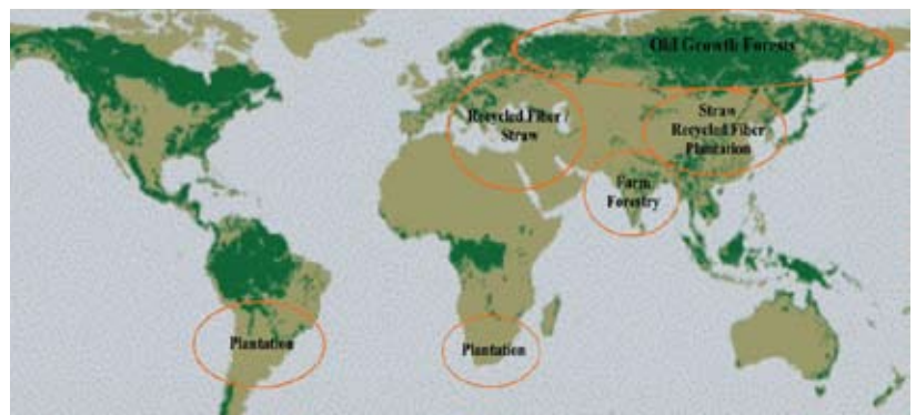
CORE INVESTMENT THEME: FIBER FOCUS