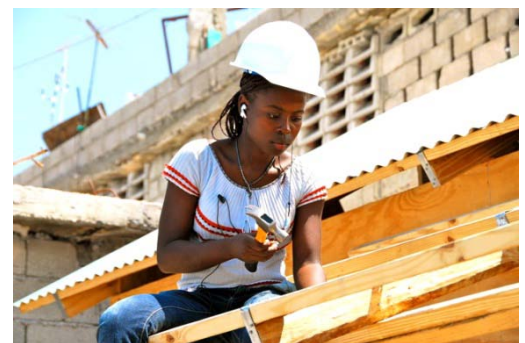
There are jobs in reconstruction