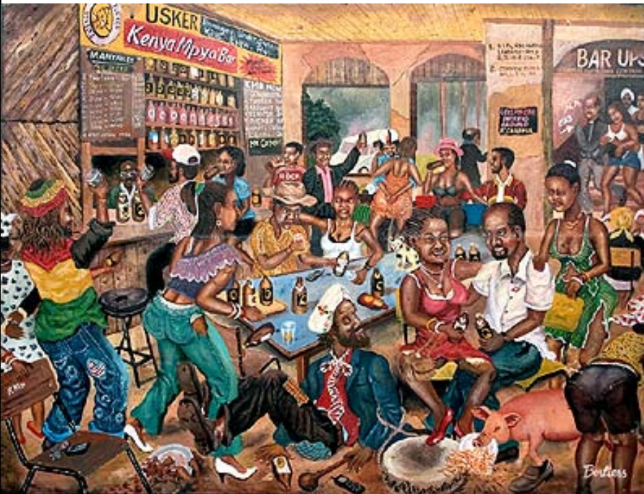
“Kenya today”

A working draft report on these conclusions on the epidemic and their implications for HIV policies and programs was shared with core experts, and fed into strategic discussions, planning and programming by the National AIDS program in Kenya. A polished draft was circulated more widely for review and discussion, and then a final draft provided input for the UNAIDS Kenya Country synthesis. This work on the drivers of the disease is continuing, and will be used in reviewing and revising the national HIV/AIDS strategy, as well as in the second Call for Proposals under the TOWA in mid-2008.