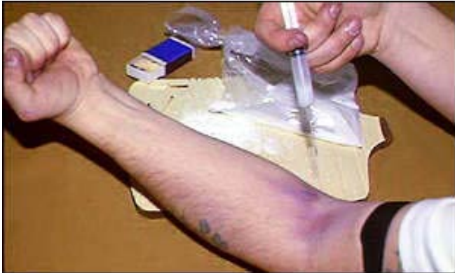
Sharing drug injecting equipment is a major driver of HIV

For example, the Vietnam and China syntheses began with the storyline that HIV was highly concentrated, with injecting drug use as the major driver of HIV transmission, igniting sexual transmission and amplifying epidemic potential - by implication, effective injecting drug use programs could radically curb epidemic potential. This initially controversial storyline was decisively supported by the evidence synthesized. Sadly, in the absence of effective injecting drug use programs, the predicted ignition of HIV in sex work has occurred and the epidemic character is slowly shifting.