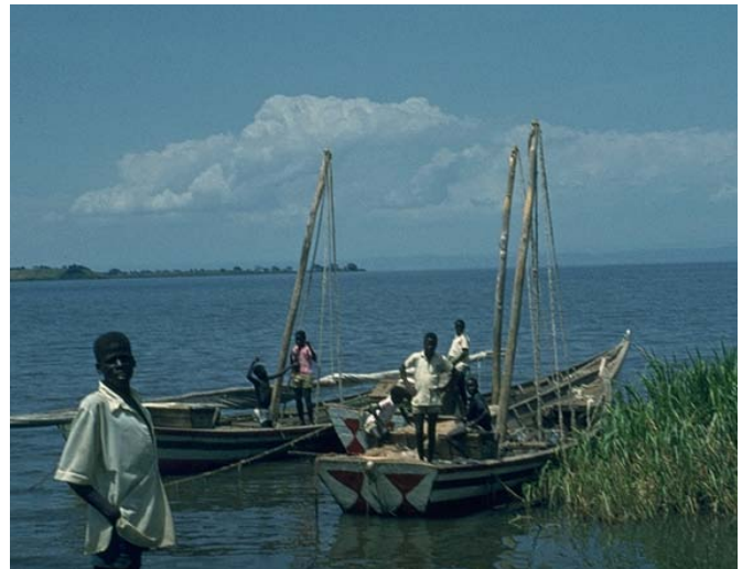
Fishermen at Kaloka, Lake Victoria, Kenya

The work was completed quickly – the idea was first discussed in April 2007, terms of reference were written in July, and work began in September. An initial draft report was reviewed in November, then presented and discussed in a technical workshop in December with approximately 70 delegates from GLIA countries and technical agencies. The findings and recommendations feed into GLIA's strategic planning in January 2008.