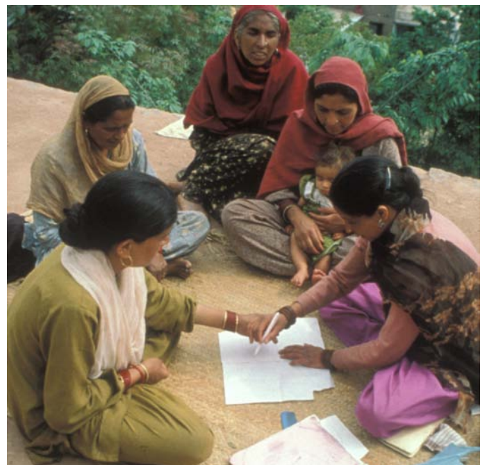
Photograph taken in India by Curt Carnemark.

Evaluation Plans. To better embed evaluation into public sector management, GAMET advises countries to develop evaluation plans as part of their national HIV/AIDS strategy planning or M&E Frameworks. The evaluation plan helps make sure that evaluations are costed and budgeted for, making them more likely to be implemented. Often countries find it useful to compile a table of evaluation, research, program reviews, studies, and other reporting activities. This promotes continuity and coherence of evaluative information for decision-making and creates knowledge for learning, accountability and management.