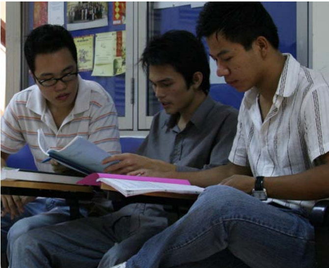
Photograph taken at Hanoi University, Vietnam