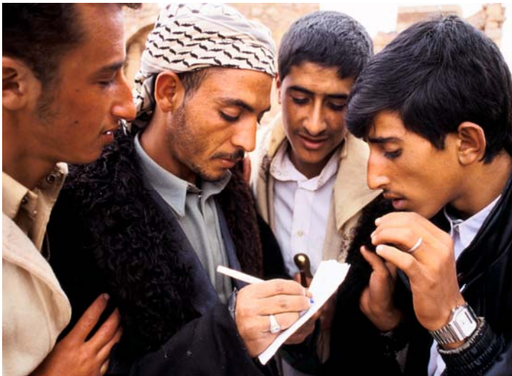
Photograph taken in the Republic of Yemen by Curt Carnemark

GAMET is committed to supporting countries manage their programs to maximize the results they achieve. Managing for Results refers to a comprehensive and integrated management system that focuses on achieving national objectives for the population while assuring accountability for public funds. Evaluative information is important to allow decision-makers to adjust the national response and refine national policies. The key elements of managing to achieve HIV/AIDS results are identified in the figure on page 1.