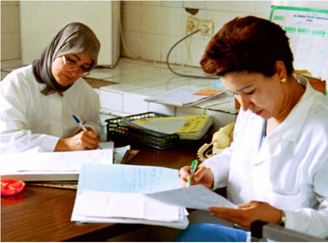
Women medical staff at Casablanca maternity hospital, Morocco.