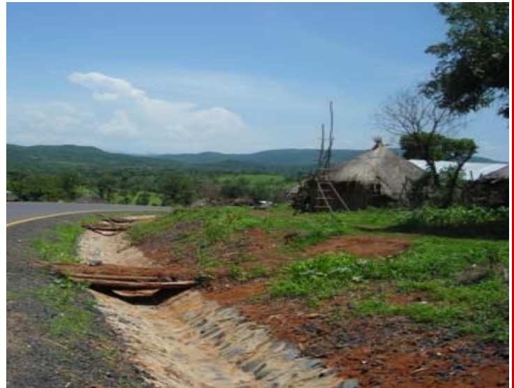
Village on the Nekempt – Mekenajo Road in Ethiopia

Despite the gravity of the impact of AIDS on road and transport workers and on their partners, families and communities, as well its effects on company profits through higher absenteeism, illness, medical costs and turnover, the transport sector was slow to incorporate HIV prevention and AIDS mitigation and care into its