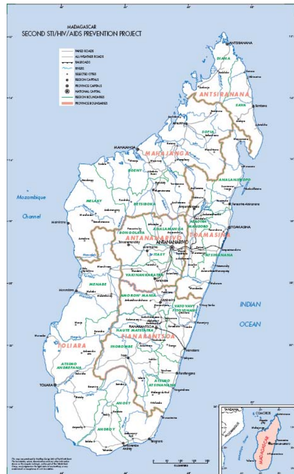
Figure 1: Madagascar and its regions

(See final page for information on Madagascar "in brief")