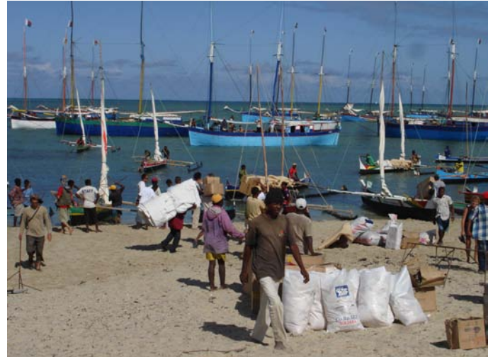
Figure 7: A small port in Madagascar

Human Development Index: With the HDI at 0.533 in 2007, Madagascar ranks 143 out of 177 countries. However, it should be noted that the index has been improving (it was only 0.400 in 1975).