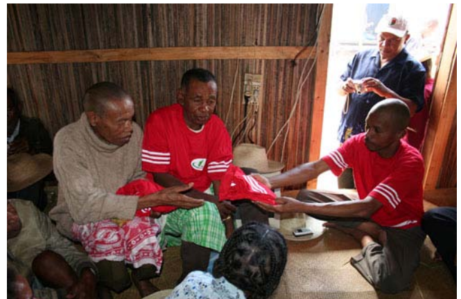
Figure 4: Information and education of a village chief

consultants under the supervision of the technical coordinators (TC) of that region in cooperation with local authorities. The technical coordinators in cooperation with the Head of the Region and the Regional Director of Health analyzed the data according to a standard method. Cross-checking was done at the central level before the results were released.