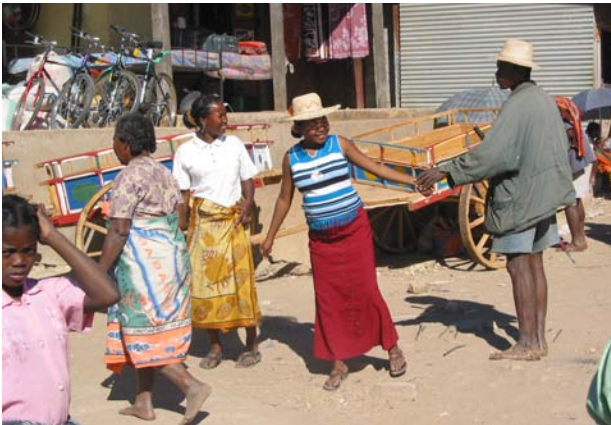
Figure 2: A market in Madagascar

To rectify this, the Executive Secretariat of the National Council HIV/AIDS of Madagascar (SE/CNLS) decided to compile all existing data, and develop a coherent epidemiological profile that would enable the policy, financial and political implications to be drawn out. The study was carried out with support from ASAP and the World Bank's Global HIV/AIDS Monitoring and Evaluation Team (GAMET), with technical support from UNAIDS, USAID, and WHO international experts.