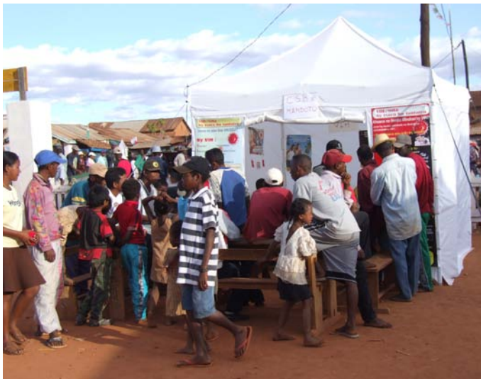
Figure 5: Voluntary counselling and HIV testing

During the collection of the data, progress was noticed in HIV programs. As with all dynamic situations, over time, discrepancies can develop between the study data and current conditions.