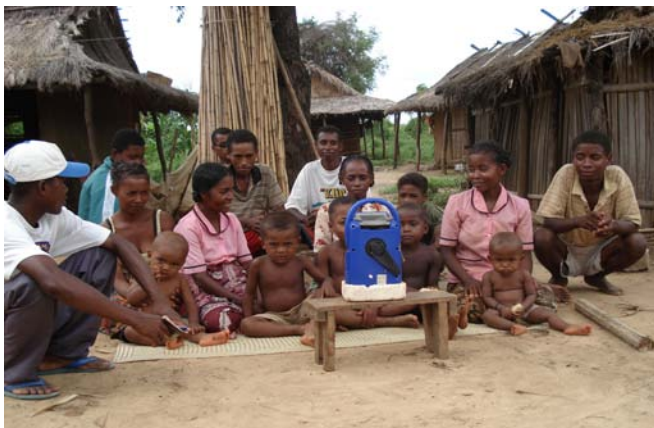
Figure 3: Prevention being discussed in a village

Studies on biological and behavioral aspects and on HIV determinants among other groups will later on increasingly strengthen the HIV and AIDS epidemiological profile in Madagascar.