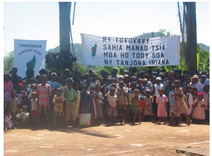
Figure 6: Awareness raising activity in a village

The new system is results-oriented. It has more results indicators that were agreed by consensus among stakeholders, than the previous indicator set. The actors have a better understanding of the objectives and value of data and of monitoring and evaluation.