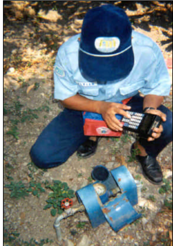
PDAM: Monitoring water quantity