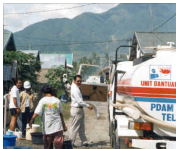
PDAM water tanker

It should be noted that these results are indicative; the sample size is small, and the number of connections is relatively small. To reach the target number of connections for 1997 as projected in the World Bank Staff Appraisal Report for the Sulawesi Urban Development Project, 9000 new connections need to be made.