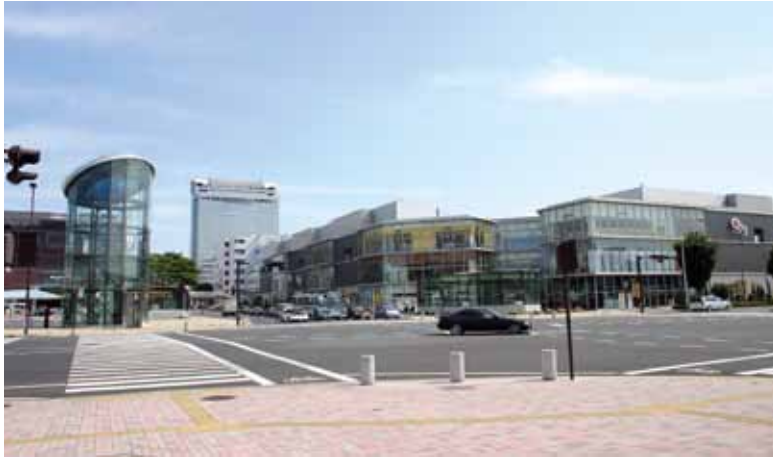
Tsukuba Express station

ernment and private research institutes located in the city. Alps are no farther than 120 km. The trip to Tsukuba from Tokyo, by train, takes just 45 minutes. Direct regular bus services link Tsukuba to Narita airport in about 90 minutes, to Haneda airport in about 120 minutes, to Tokyo station in about 90 minutes, as well as to Kyoto, Osaka and a variety of further cities.