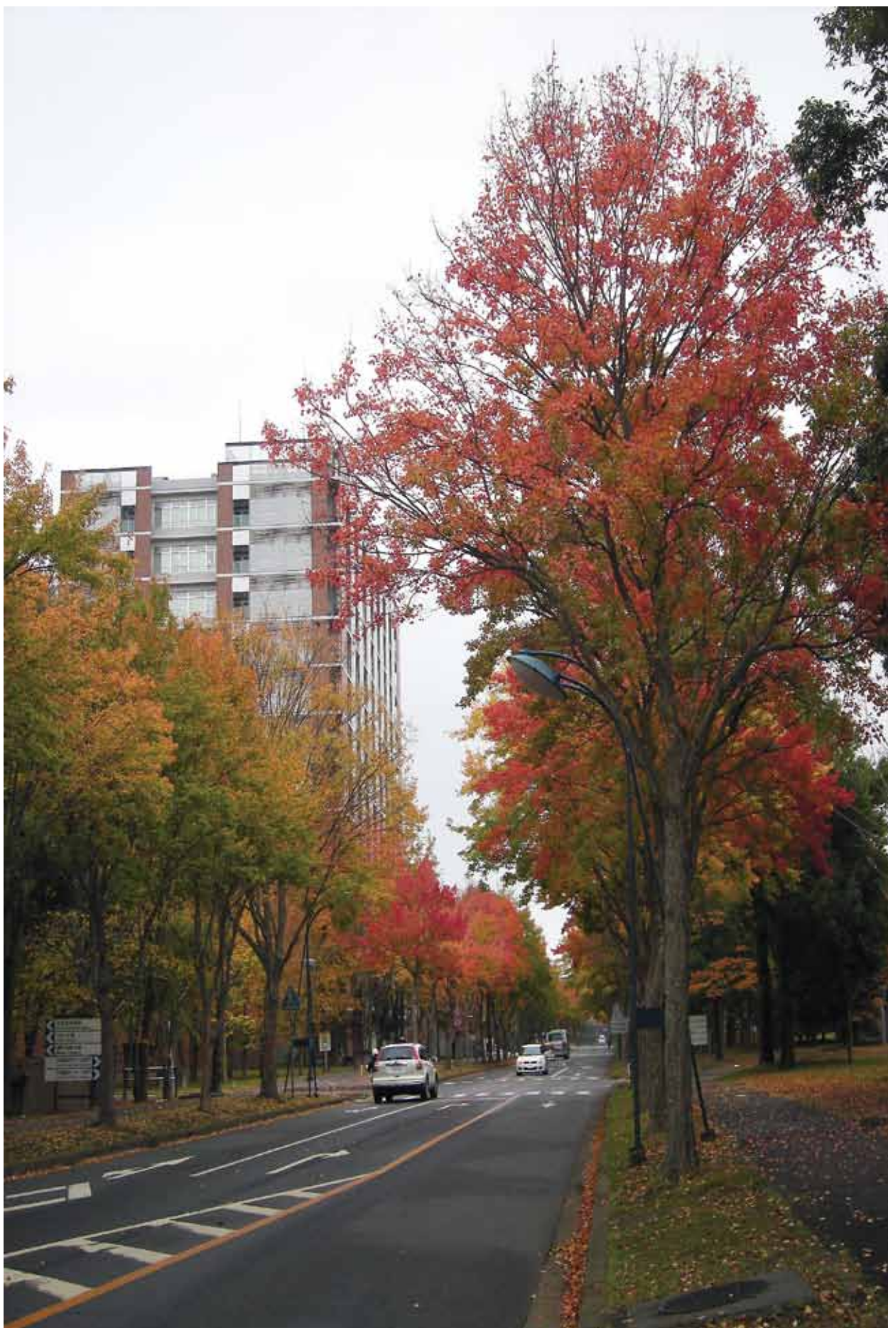
Internal road, the University of Tsukuba