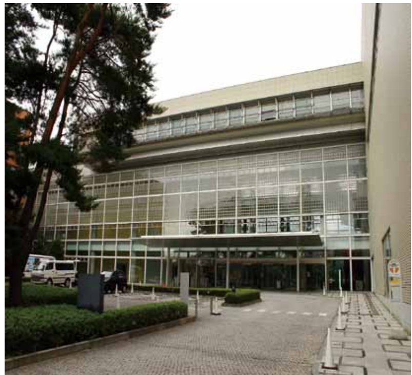
Tsukuba International Convention Center

Most of the housing facilities in Tsukuba Science City have been designed to facilitate a living environment that integrates professional and home life activities. The Tsukuba University Hospital is recognized as a first rate regional health care facility, and the Tsukuba Medical Center as well as several other private hospitals are additional providers of medical care. Thirty eight elementary schools, fifteen junior high schools, and three high schools operate in the residential areas. In addition the city possesses many parks and other green areas.