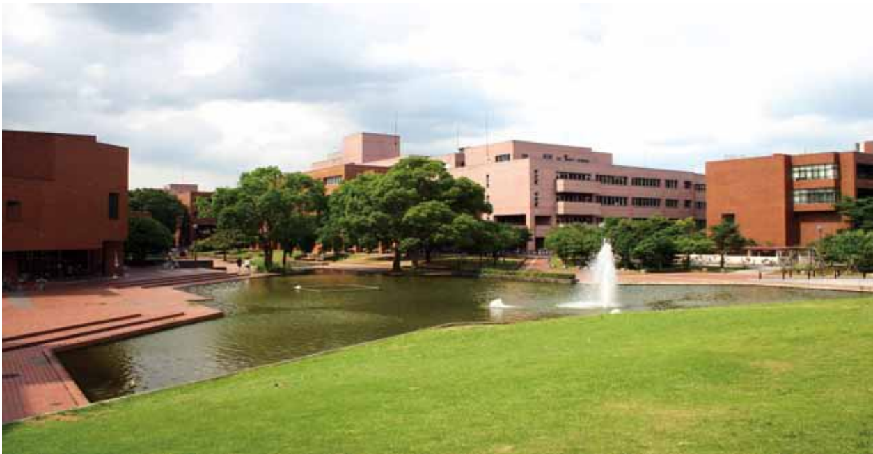
General view of the University of Tsukuba

After reviewing the basic theory of multiple regressions with K variables, the course will cover such methods as generalized classical regression model, simultaneous equations model, and panel data analysis.