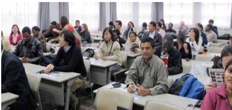
Professional Trip to Yokohama (March 2010)

Participation in the seminar series, video-conferences, internships, and professional trips, is required as these are integral components of the Program.