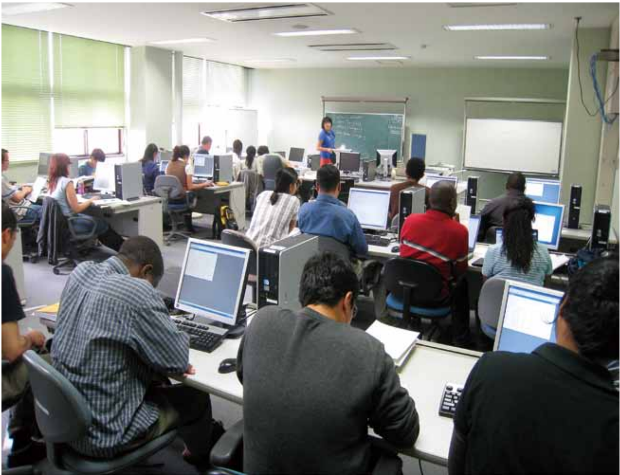
Practice session at computer lab of Graduate School

In this seminar, students are expected to make oral presentations of case studies, applying the tools of Economic Sociology (networks, market formation, value chains, etc.). It also involves discussion and debates related to economic development, market failures, risk and uncertainty, etc.