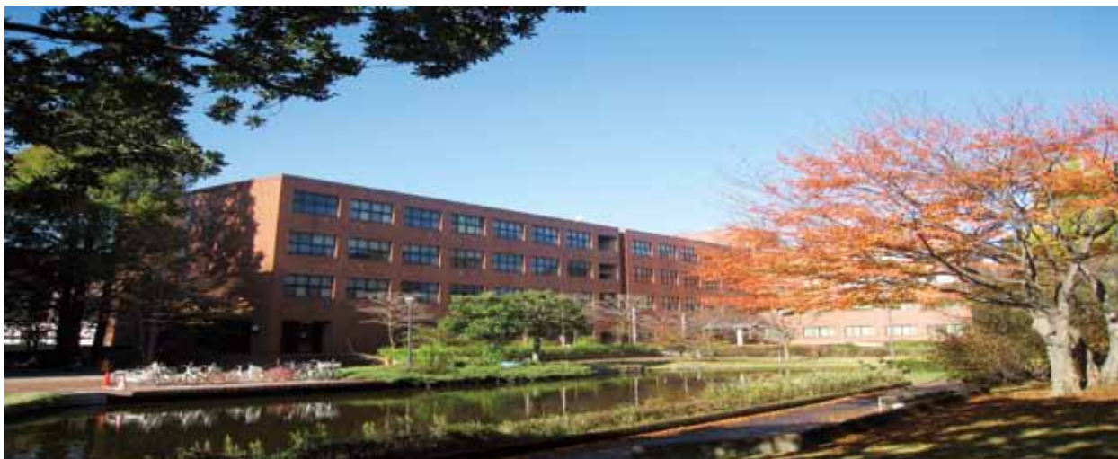
Graduate School of Humanities and Social Sciences, University of Tsukuba