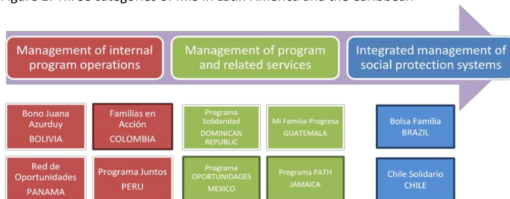
Figure 2: Three categories of MIS in Latin America and the Caribbean

In Latin America and the Caribbean there is a wide range of MIS models. Program and policy objectives define the scope of the MIS and determine its level of complexity and degree of integration with other programs and/or institutions. These MIS can be classified into three categories, based on the scope of the MIS. Figure 2 classifies 10 CCTs 2 in Latin America and the Caribbean according to these categories. Within each category, every program is at a different stage of development of its unique MIS. The programs with a dark border have more highly developed MIS within their category.