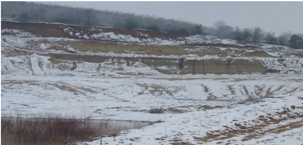
Surface mines for exploitation of quartz sand in Mirosal

such as: quartz sand (close to Mirosala), argyle sand (close to the agricultural airfield), lead and zinc minerals (in Mirash village), mineral water (in the village of Gaçkë) and layers of lignite located throughout the area of the Neocene deposits, and also potential oil at a depth of 1600m. It is assumed that in the east of the Ferizaj Municipality there are argyle reserves. Close to Zllatar village, there are leucite reserves (a phosphor mineral), which can be used in producing artificial fertilizers.