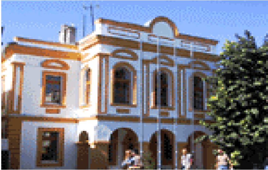
Building of Gjilan Municipality Assembly

In addition to the Working Groups, the Stakeholders Forum was established. The members of this Forum were different stakeholders in the municipality such as from administration, Assembly, business community, civil society, etc. The Forum contributed with suggestions and analysis of the different phases of the strategy drafting. The Stakeholders' Forum met four times during the process (at the end of each action plan) in the premises of the Regional Didactic Centre in Gjilan (see the composition in Annex).