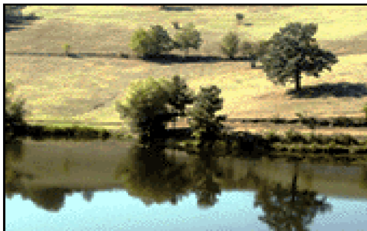
A landscape in Gjilan

Main economic sectors in the municipality of Gjilan until the first half of past century have been agriculture, especially livestock sub-sector. The installation of factory capacities in textile, tobacco, radiators, bread and other industries started since 1957. Industry in Gjilan was relatively stable until the 1990s. Its most intensive period of development was in the period 1957-1986 when the benefits of these enterprises were mostly felt, leading to an increase in the living standards of Gjilan citizens. During the last decade, due to the period of occupation, most industrial capacities were ruined. These days most of the activities that are carried out are in trade.