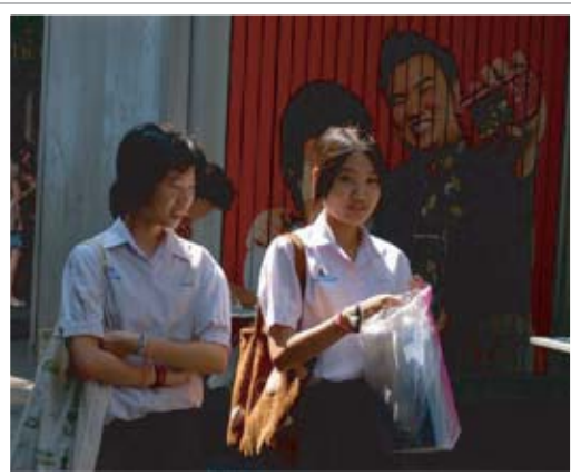
Building human capital requires more than just schooling, the WDR07 says

Building human capital, however, takes more than just schooling, argues the WDR07. It also means ensuring that young workers can use their skills productively as they seek their first job; that their health is safeguarded as they experiment with new life experiences; that they become responsible young parents themselves; and that they become involved in their communities and societies. Youth should have opportunities to use their talents at work and to participate as active citizens, the WDR07 argues. Government, it says, have a lot to do to expand those opportunities.