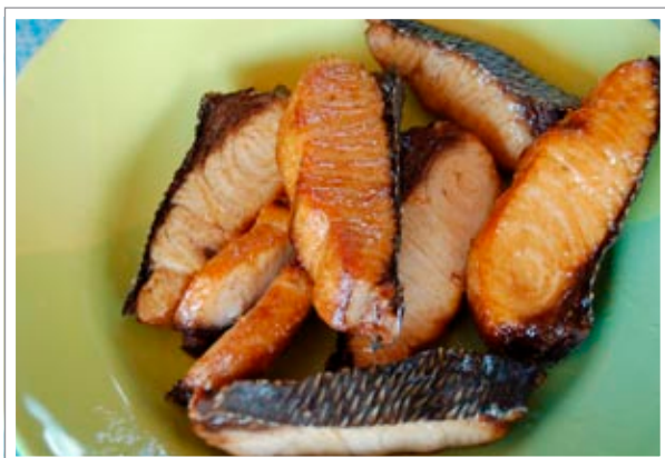
Yum! Fried fish