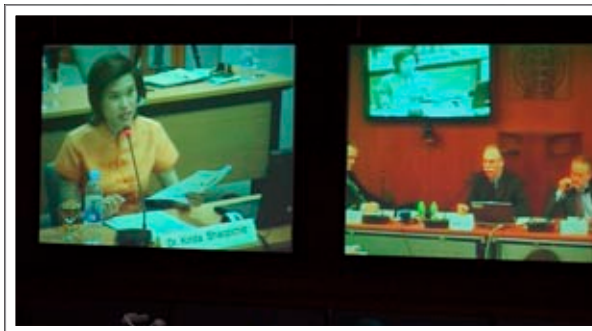
Video conference interactions during the launch of the report at Chulalongkorn University, December 13, 2006