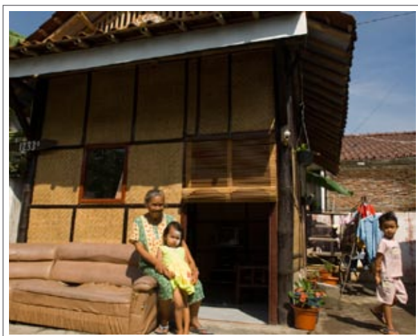
World Bank funding helped build new houses for people in Yogyakarta made homeless by the 2006 earthquake

“That includes providing people with access to basic services, helping governments deal with a return to civil conflict, filling the infrastructure gap or providing advice on how to deal with income inequality. The list of challenges is long, even in a region that has grown so quickly. We continue to have a major role to play, and we can now put all our effort and time into it.”