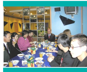
A final lunch to say good bye to each other closed the event