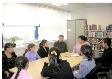
Talk in the PIC

World Bank's PIC provided the centers with additional information about the WB activities in Uzbekistan, web-sites and contacts in PIC to get more info if needed. More than 60