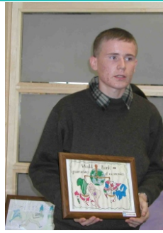
The winners explained their thoughts behind the pictures and drawings