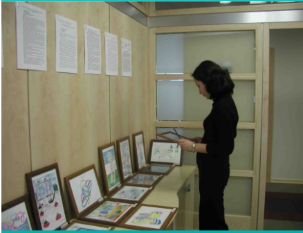
The drawings of all participants were displayed in the conference room