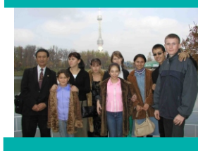
A visit to Japanese Garden was a real fun