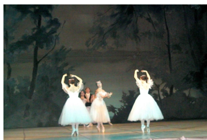
First time at the Ballet

To reach the pupils in rural areas of Uzbekistan the announcement was circulated through IREXes “School Connectivity Program”, which connects more than 60 schools in the villages situated far from regional centers and provides Internet to School Internet centers established by the Program.