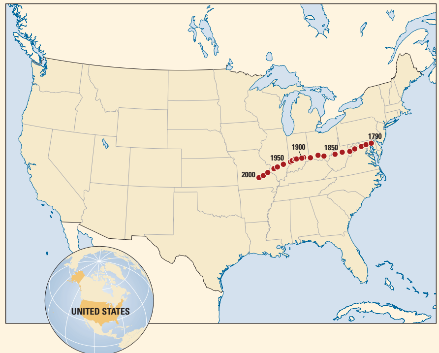
Map G1.1 The U.S. geographic center of population gravity moved 1,371 kilometers between 1790 and 2000