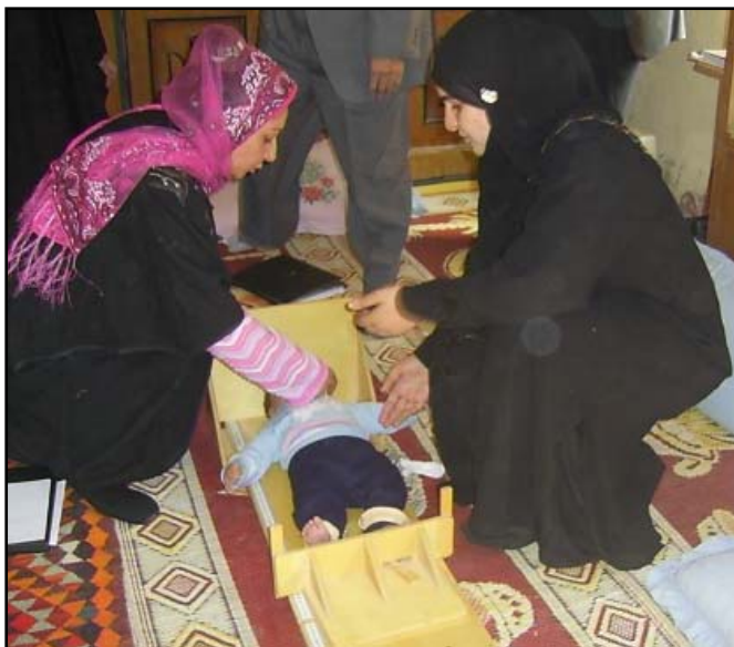
Measuring the height of a child in Albu Risha village, Muthana, Southern Iraq

WFP is working closely with the Ministry of Planning's Central Organisation for Statistics and Information Technology (COSIT) and the Kurdistan Regional Statistics Office (KRSO) in building up Food Security Units in each governorate to monitor, analyse and report on the local food security situation. Just over US $1 million was received from UNDG ITF in December 2007 towards this initiative. One element of the capacity building process is undertaking a comprehensive Food Security Survey.