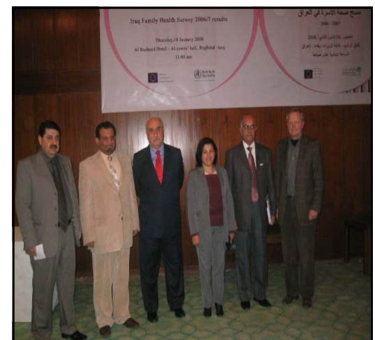
From right to left: EU Ambassador, the Ministers of Health, WHO Representative to Iraq, Minister of Planning, MOH Inspector General and Deputy Minister of Health in Iraq

The Launch took place on the 10 January 2008 in Baghdad with the presence of dignitaries. The IFHS Survey is available at: www.emro.who.int/iraq/ifhs.htm