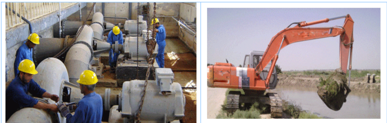
February 2005. Rehabilitation of pump stations & canal cleaning near An Nasiriyah (South of Iraq)