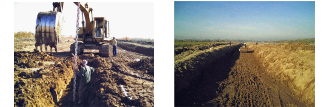
Digging and land leveling of a canal in Diyala near Baghdad

“The project will create more than 20,000 jobs”