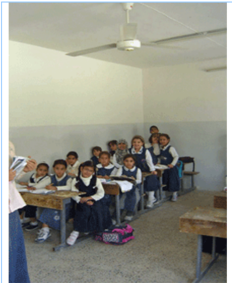
A classroom that have been rehabilitated as part of the Emergency School Construction and Rehabilitation Project .

“US$ 385 million is obligated for projects funded through the ITF.”