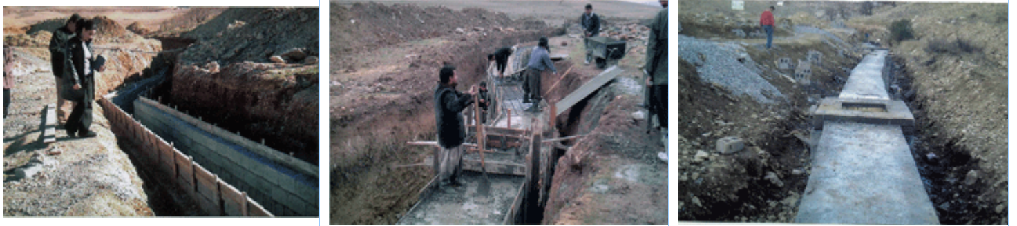
February 2005. Construction of a water conduit near Sulaymaniyah in Northern Iraq. The “Karesez” will be used both for irrigation and water supply.

The US$ 20 million Emergency Community Infrastructure Project (ECIRP) finances a program of 20 labor-intensive and small scale civil works sub-projects for water supply, sanitation, irrigation and drainage infrastructure. The sub-projects are implemented across 15 governorates in Iraq. The project generates immediate employment, while addressing emergency needs at the community level to improve the rural water infrastructure.