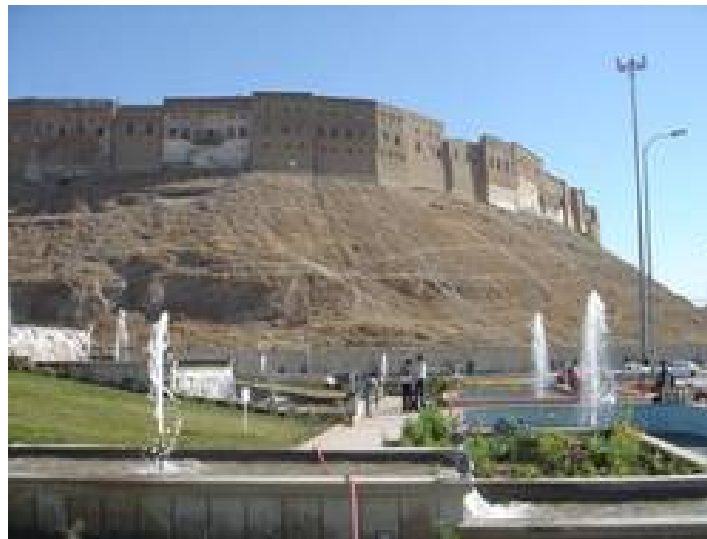
Erbil, Kurdistan - Iraq