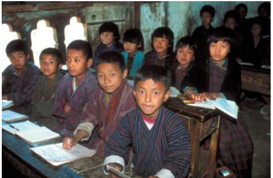
JSDF grants are working to improve access to education and keep children at-risk of dropping out in school.

The Social Protection Reform Program ($575,000) aims to pilot alternative approaches to assist the poorest groups of society and demonstrate alternative social protection mechanisms for the government. The grant will strengthen the capacity of local parent-teacher associations (PTAs) to enable them to identify and assist the neediest children and families through the provision of cash and in-kind grants. The grant will also implement school-based nutritional and health prevention programs by funding school lunch programs, nutrition monitoring and health check-ups. The PTAs are being supported with a combination of logistical support and resources for the purchase of cooking or gardening equipment, the development of school meals, and/or payments for medical help (for the health check-ups of children).