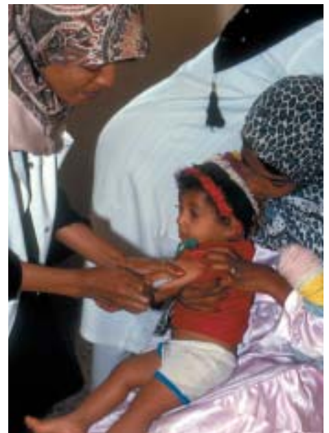
JSDF is working to improve the delivery of health services to the most needy in society.

Since the launch of the JSDF in June 2000, significant progress has been made in the four rounds of funding during the first year of operations.