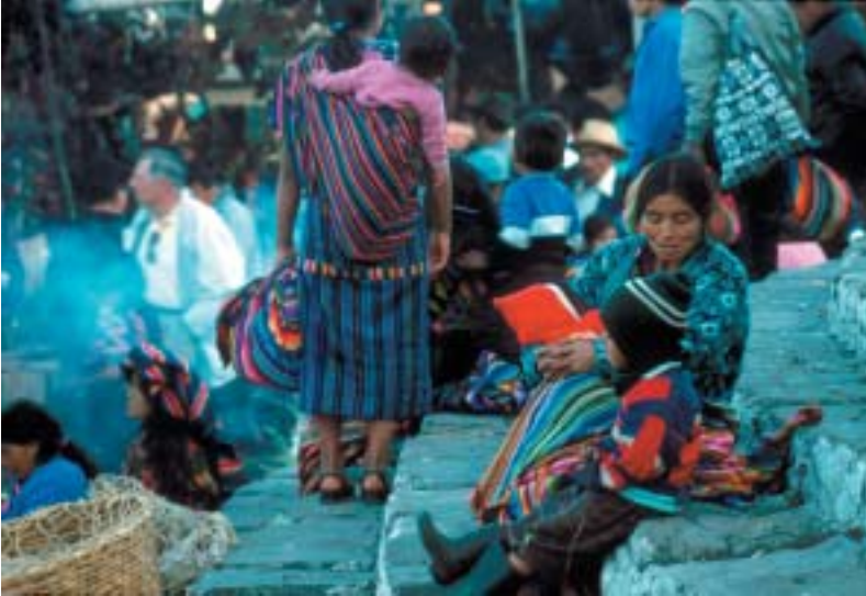
Social Protection grants received the majority of JSDF Funds in FY 2001 ($10.2 million) especially targeting poor women and children.