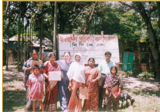
Australian volunteer work at BPKS as physiotherapist trainer and in total 32 local people trained with 3 month training to work in community as home based therapy provider