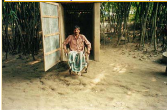
Accessible latrine enjoyed by a wheelchair persons