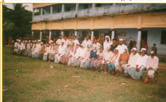
After eyes operation