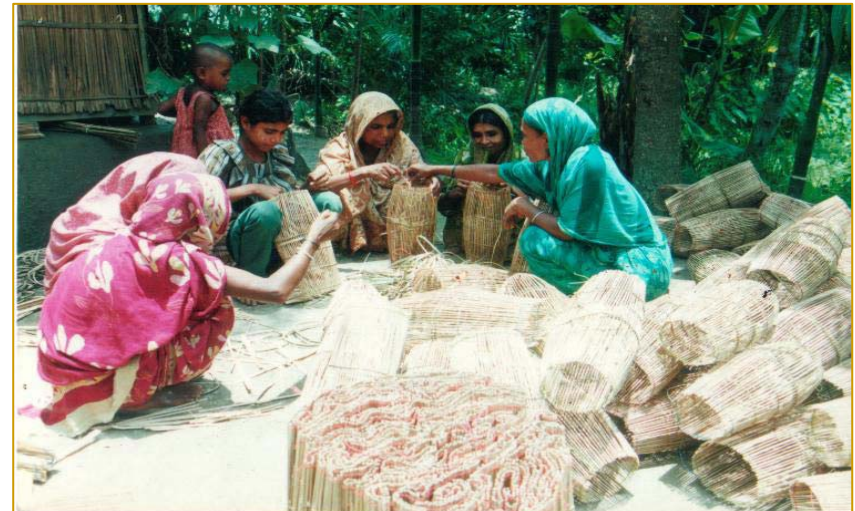
A small group all member woman with disability jointly manage this business by making bamboo mate that supplied to marketer