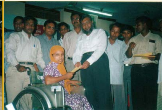
Woman With Disabled Person Receive a Wheelchair Dyputy Commissioner