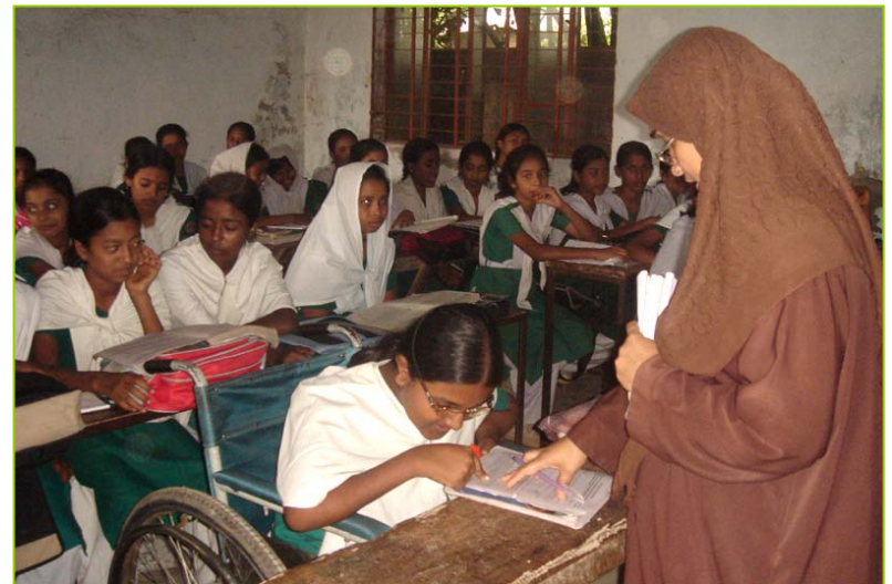
Photo: A CWD in her class room 14