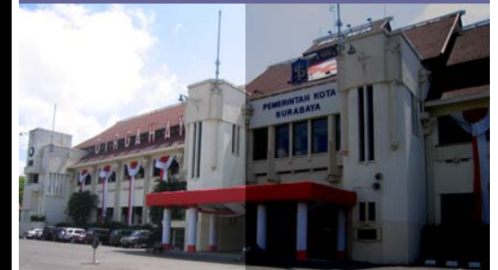
Surabaya City Office

Despite the action of all Surabaya's stakeholders to lessen negative impact of climate change and related natural disaster, the overall strategic measures in Surabaya still needs greater improvement in the future.