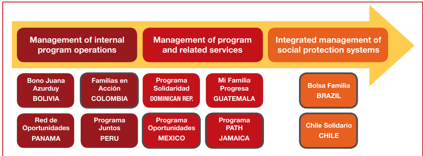
Figure 2: Three categories of MIS in Latin America and the Caribbean

If well designed and used appropriately, an MIS in any category can be an effective tool for program management. MIS can evolve in different ways. If program objectives stay focused on program operations, the MIS remains in the first category, but can gain sophistication. If program objectives expand to address other programs, services, and/or institutions, the MIS moves along the continuum to a different category as its scope becomes broader.