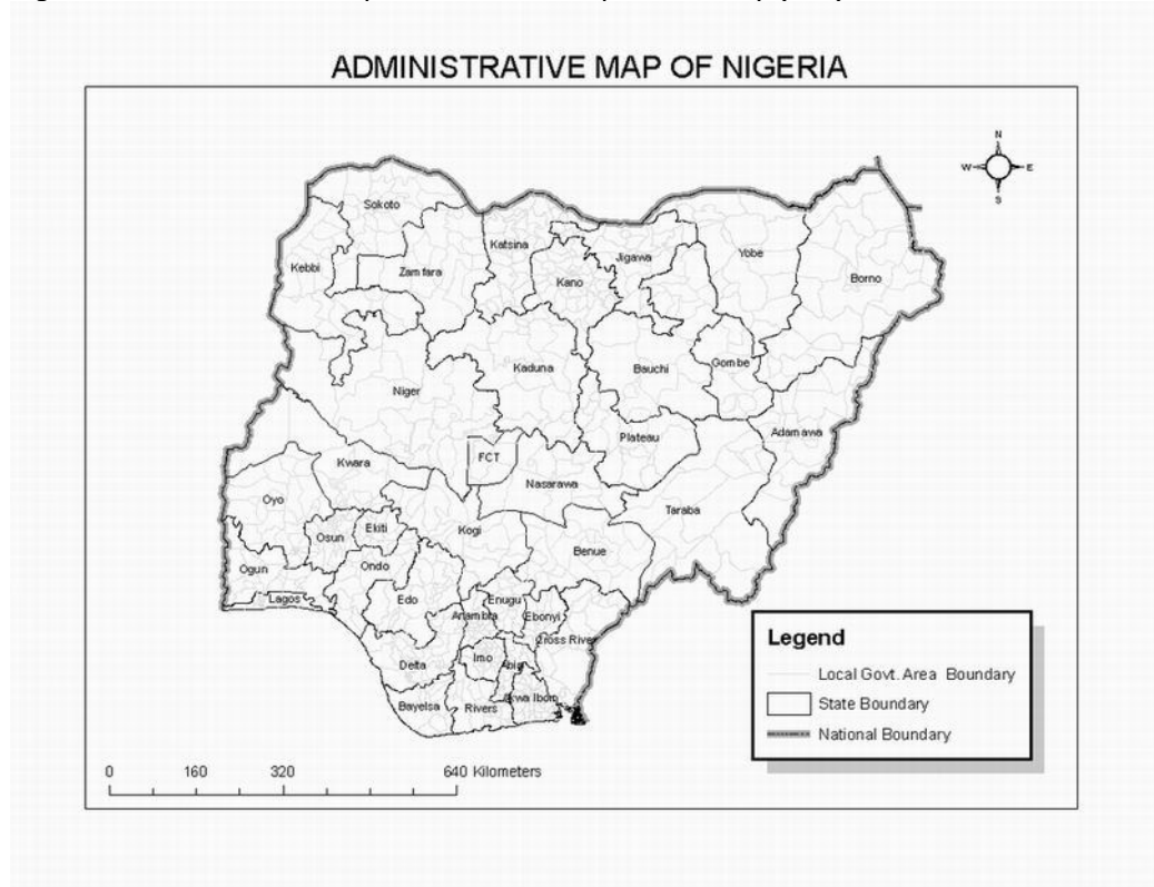
Figure 1: Administrative map of Nigeria.

Nigeria consists of 36 states plus the Federal Capital Territory (FCT).