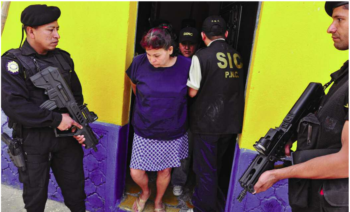
Hundreds of police officers, backed up by the army, took to the main streets of Guatemala City to provide security.