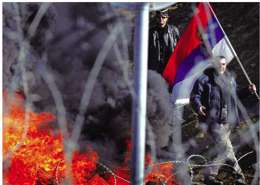
Several hundreds former Serbian army reservists attacked Kosovo police in a series of violent incidents on the Kosovo-Serbia border at Merdare to protest Kosovo's independence.

Neither the United Nations, the African Union, the OAS or the EU—nor individual nations—has built an independent capacity to manage the full range of post-conflict security requirements, from enforcing the law during the immediate aftermath of conflict to assisting countries in constructing