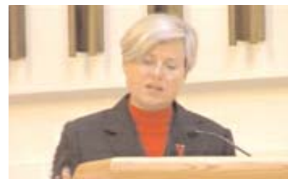
Eveline Herfkens, Netherlands Minister for Development Cooperation