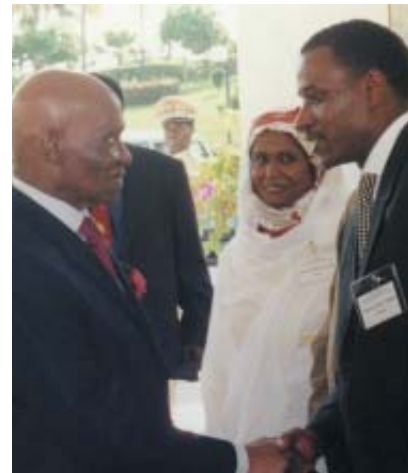
Senegalese President Abdoulaye Wade (left) greets delegates

The country delegations took the lead in insisting on harmonization among donor policies and procedures, and