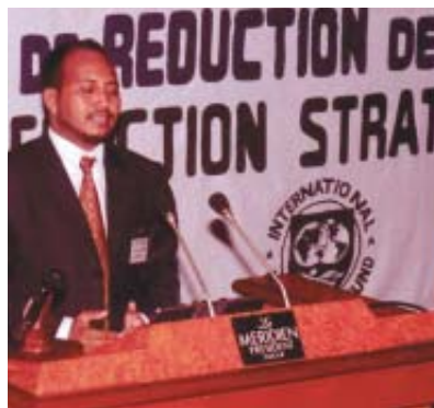
Participant addresses Forum

Discussants also examined the roles of key actors, including local governments, civil society, and the media. PRSP consultations