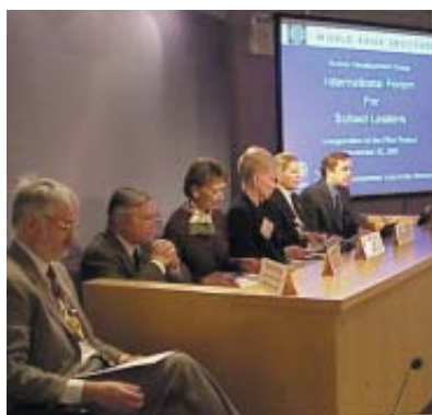
World Bank and Maryland State Department of Education connect with Ugandan Colleagues

For conference materials and presentations go to http://www.10iacc.org/index.html . For more on the Bank's involvement see http://worldbank.org/wbi/governance/prague2001.htm . For general information about the Bank's anticorruption and governance work visit http://worldbank.org/wbi/good-governance/ or http://www1.worldbank.org/publicsector/anticorruption/index.htm .