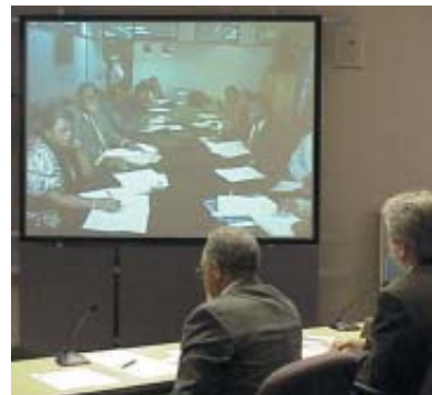
Ugandan educators at Distance Learning Center in Uganda

During the year-long pilot project, school principals will collaborate in problem solving, and will work together on strategic action plans to promote good